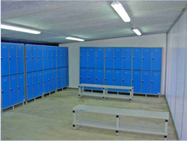
Example M3 P2.