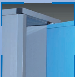
Swing door, without hinge.