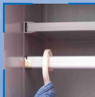
1/2 Shelf and hanging bar.