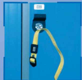
Numbered Key bracelet.