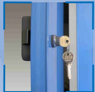
Closing for skid.