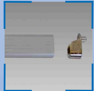
1/2 shelf and coat rod.